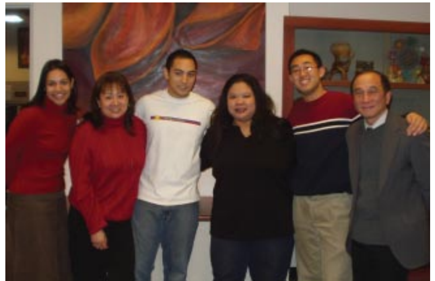
MSU faculty and students involved in raising money for an Asian Pacific Student organization endowed fund gathered at the Multicultural Center in the Union building.

While these four funds are considered the primary highlighted funds of the 2004 All University