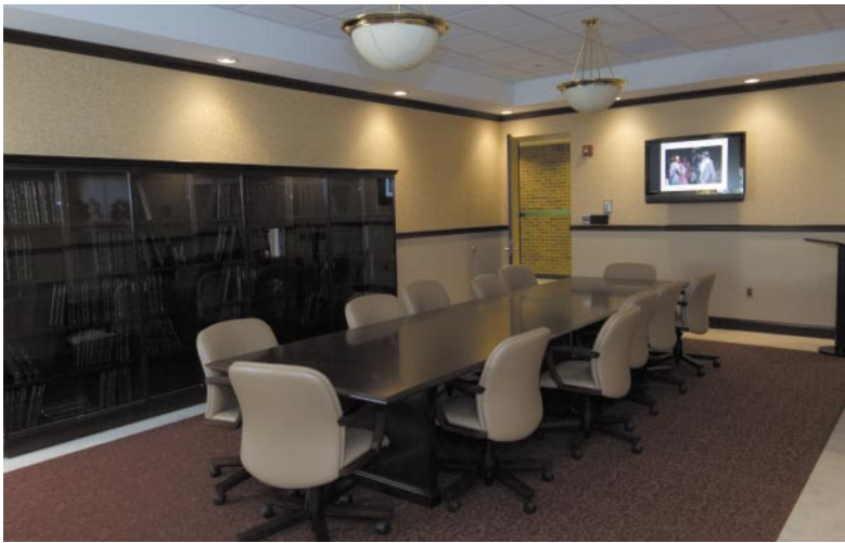
The new Bradley S. Greenberg Graduate Seminar Room on September 15, 2006, the day of its dedication.