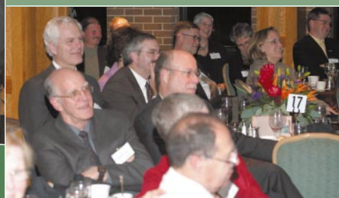
Dinner guests share a laugh during the program.