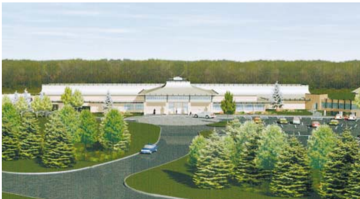
The James B. Henry Center for Executive Development will open in the fall of 2001 and provide multidisciplinary professional educational opportunities.