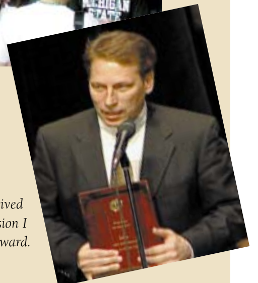
Coach Tom Izzo received the Verizon/NABC Division I Coach of the Year Award.