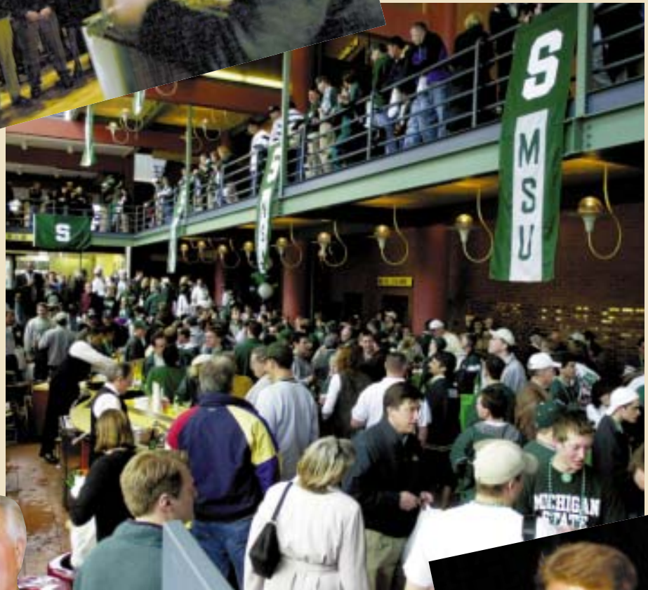
The pep rally in Minneapolis was host to Spartans of all ages.