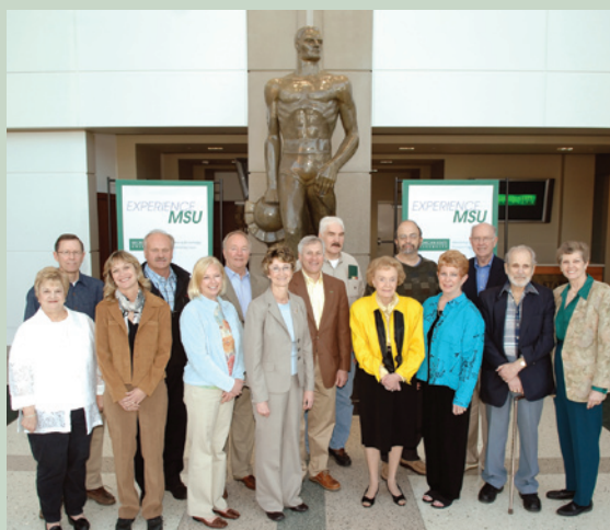
Participants in the 2007 edition of Experience MSU visited the original Sparty statue now housed in Spartan Way, the building adjacent to the Stadium.

The 2007 program included tours of the Center for Comparative Oncology in the College of Veterinary Medicine, the SOAR Telescope viewing area, and the interior of Beaumont Tower, as well as presentations about the Center for Language Education and Research, pediatric genetic medical research, biofuels, the Knight Center for Environmental Journalism, and the MSU Study Abroad program. Adding to the enjoyment was a concert at Wharton Center by the MSU Jazz Band and the Professors of Jazz, a private dinner at Cowles House and excellent