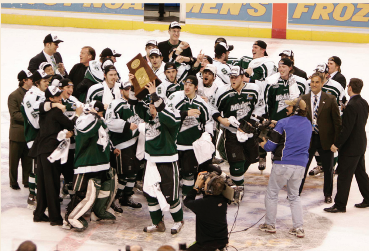
The 2007 MSU Hockey Team celebrates with their national championship trophy in April.

If you would like more information on making a gift to the Essensa Scholarship, the MSU Hockey program or any other area of Intercollegiate Athletics at MSU, call (517) 432-4610.