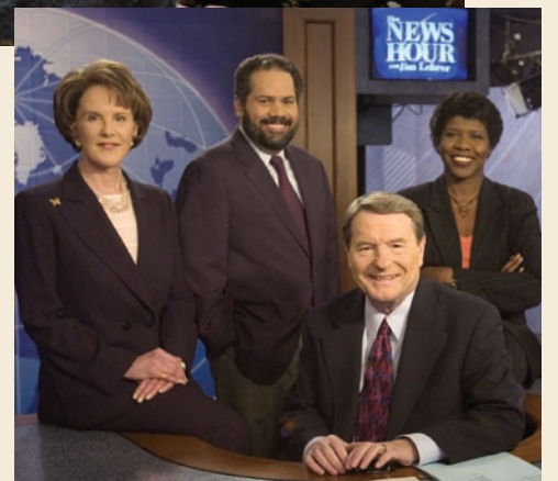
This endowment will provide funding for national programming such as Masterpiece Theatre and News Hour (above).