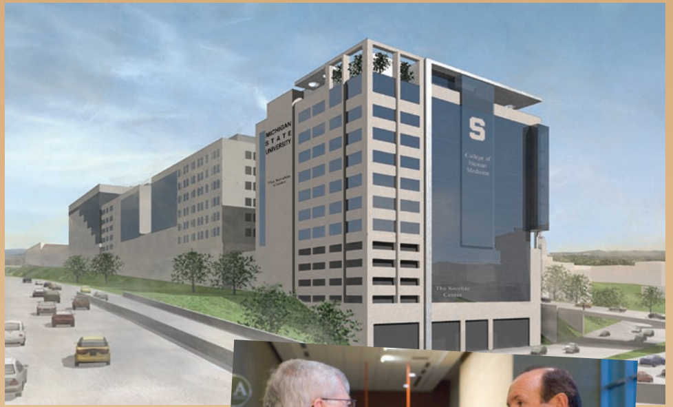
An artist's rendering of The Secchia Center was shared at the program announcement.