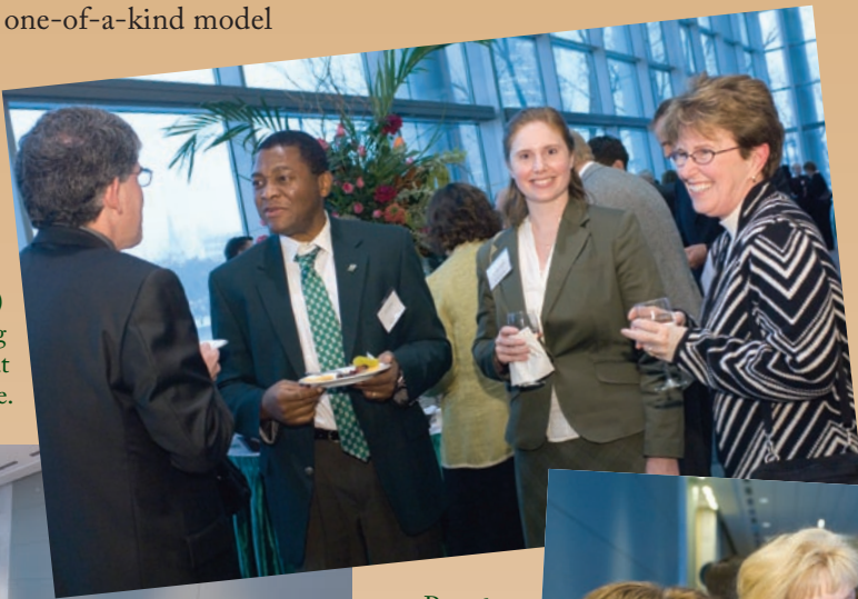
(Right and Below) Guests enjoyed mingling at the reception held at the DeVos Place.

O n January 18, 2007, the MSU Board of Trustees met in Grand Rapids and approved the purchase of land for “The Secchia Center.” This new building, which will be located in downtown Grand Rapids, will serve as the new home of MSU’s College of Human Medicine. A reception and program held at DeVos Place also featured representatives from the West Michigan partners, including Spectrum Health, Saint Mary’s Health System, Van Andel Institute, Grand Valley State University and Grand Action, as well as community partners. Over 500 guests were at the announcement detailing MSU’s vision for a one-of-a-kind model for medical education and research in the 21 st Century.