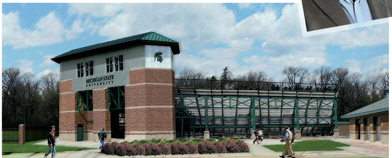
MSU's new softball facility will be named Secchia Stadium in recognition of a $1 million gift from alumnus Ambassador Peter F. Secchia.