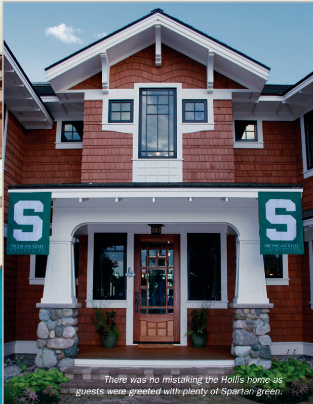
There was no mistaking the Hollis home as guests were greeted with plenty of Spartan green.