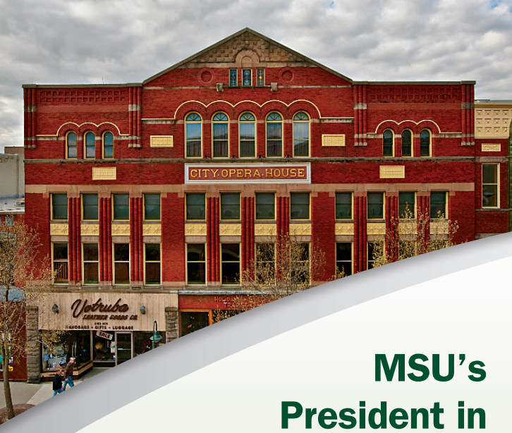
Traverse City's Opera House, now managed in partnership with MSU's Wharton Center, was the venue for the 2010 President's Reception in Northern Michigan.