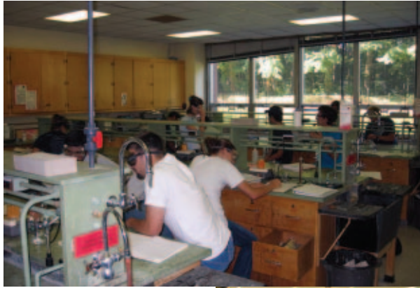
Before renovations (above) and after renovations (right).

$1.5 million grant from the Rollin M. Gerstacker Foundation and a $250,000 gift from the Charles J. Strosacker Foundation are supporting the renovation of science laboratories in Holmes Hall, home of the Lyman Briggs School of Science.