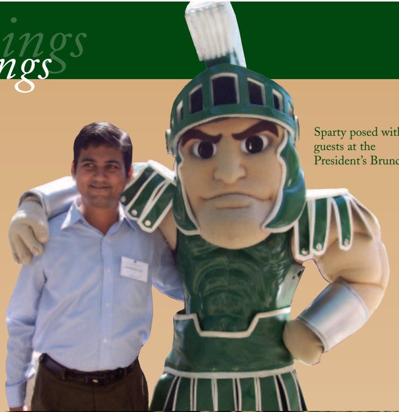
Sparty posed with guests at the President's Brunch.