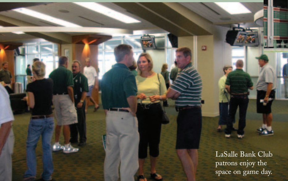
LaSalle Bank Club patrons enjoy the space on game day.